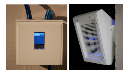
Figure 2: Hullabaloo's Encased Mobile Phone and Speaker

Currently, ringtones on mobile phones have a private meaning but create a public experience. The idea is to see if we could generate a "place based ringtone" that would be dynamic mashup of the people nearby. We use the phone's built-in Bluetooth sensor to sniff nearly Bluetooth devices. We are able to retrieve a unique ID and name of the device. The ID also provides information on the device manufacturer. The results of this live scan are shown on the screen of the mobile phone. Similarly, each ID triggers a unique audio output that mixes with the others nearby. The resulting sound is played out the speaker. A schematic diagram of this interaction is outlined in Figure 1. The sounds are deterministic – that is if the same people are around it will produce the same sound.