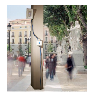
Figure 3: Deployed Hullabaloo Object of Wonderment

We are experimenting with enabling deployment of such dynamic ringtones to phones. Similarly, we are experimenting with allowing the uploading of new audio content to the system. The entire system is shown below.